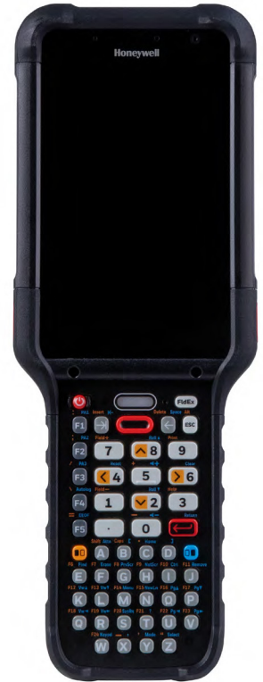
Fig 1: CK67 Ultra-rugged 5G mobile computer on the Mobility Edge™ platform

The CK67 is designed to endure the most challenging environments in warehouses and DCs. Warehouses are as busy as ever and operators need to keep their workflows running efficiently with maximum uptime. Users in warehouses can rely on the CK67, withstanding up to 8ft drops across operating temperatures and 4,000 1.0m tumbles. Users can be confident with the intense durability testing the CK67 undergoes before release, that it will solidify and keep operations and is the ultimate long-term investment.